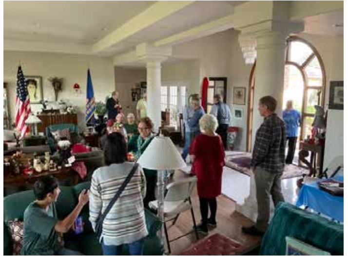
Christmas Party Meeting

Looking forward to Pittenger Camp 21 continuing to prosper and grow in numbers in 2023.