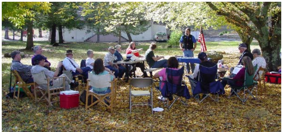
Joint meeting of Ellsworth Camp #23 and Ivy Stiers Auxiliary #23, conducted in the Memorial Grove, Veterans Home of California on Oct. 17, 2009. The tree grove includes trees planted from seeds and cuttings from various battlefields around the world. Several Civil War battlefields are represented.