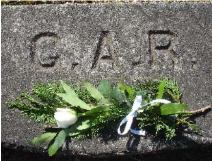
One of the floral bouquets used in the Auxiliary #23 ceremony, containing sprigs of evergreen, laurel, and a white rose. Photo was taken at the entry step to the GAR plot, St. Helena Cemetery.