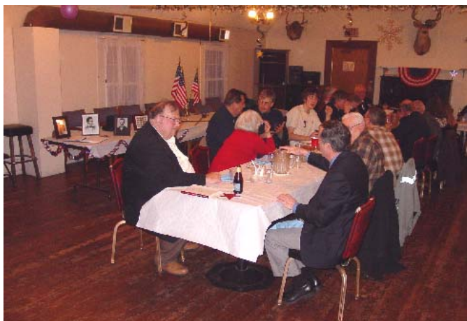
Lincoln Dinner. Washoe House, Feb. 12, 2009. Camp and Auxiliary 23 members and guests.