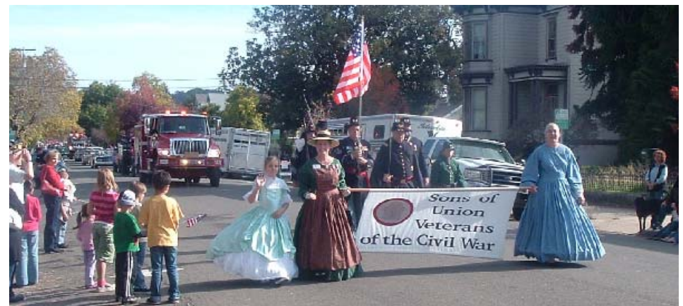
Camp and Auxiliary members marching in the Petaluma Veterans Day Parade, Nov. 11, 2009. We teamed up with members of the ACWA and NCWA (including the California Consolidated Drum Band – out of view) to make this one of our best parades ever!