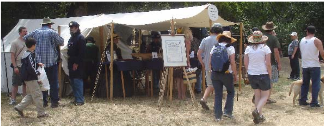
SUCW information tent at "Civil War Days" at Duncans Mills, Sonoma County, July 18 and 19, 2009.