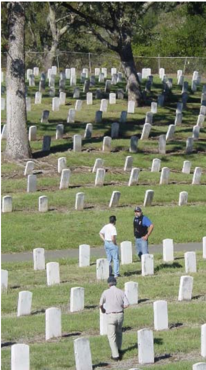
Camp and Auxiliary members exploring the cemetery at the Veterans Home of California, Yountville, Oct. 17, 2009.