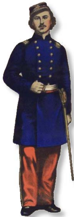
Col. Elmer Ephraim Ellsworth (1836 – 1861)