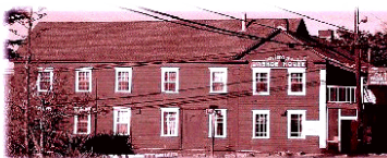
Where soldiers in 1865 "braced" themselves for battle!

Corner of Stony Point Road & Roblar Road, Petaluma