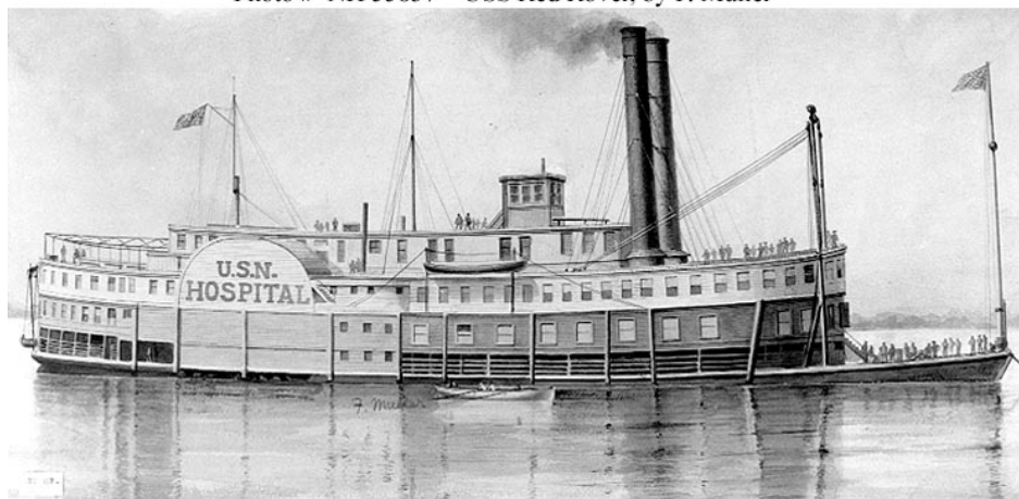
Image of the USS Red Rover courtesy of the United States Naval Historical Center.