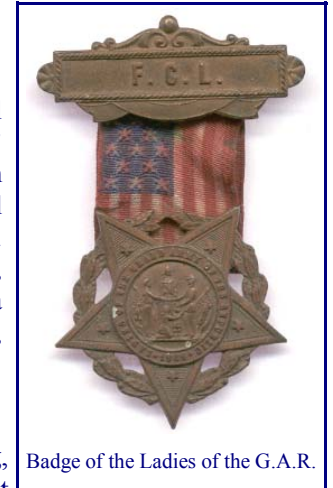
Badge of the Ladies of the G.A.R.