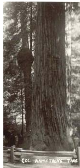
The Colonel Armstrong Tree

http://freepages.history.rootsweb.ancestry.com/~enderlin/calistoga/cw/calistoga-ve-1903.htm