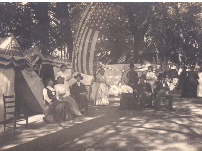
Members and families of Calistoga's Gov. Morton Post, No. 41, G.A.R., at a Northern California Veterans Association encampment (probably 1903).

Encampment activities included parades, speeches, concerts, and various other forms of live entertainment. Occasionally, special services were conducted to dedicate memorials to the old soldiers. Such was the case during