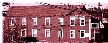
Where soldiers in 1865 "braced" themselves for battle!

Corner of Stony Point Road & Roblar Road, Petaluma