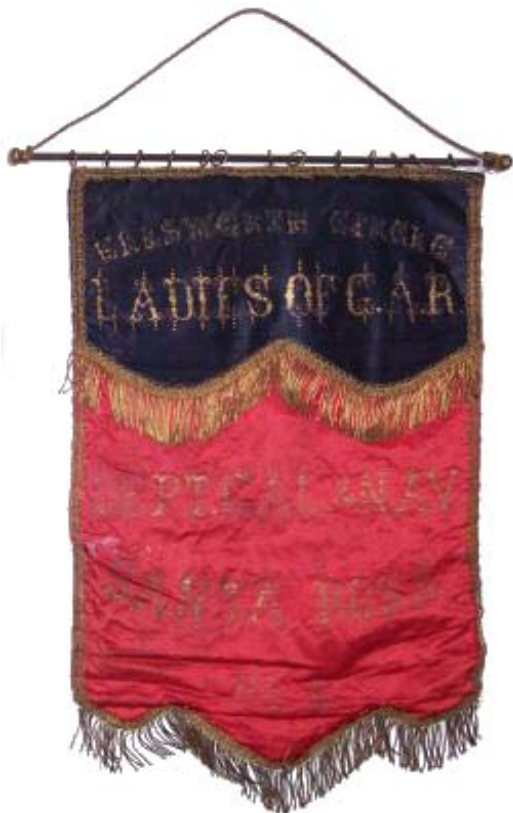
Banner of Ellsworth Circle, No. 6, LGAR.