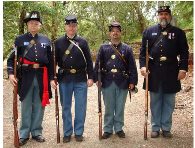
Photos from Memorial Day, Calistoga

Top Left: Some of the newly placed memorial bricks in the Civil War section of the Calistoga Veterans Memorial.