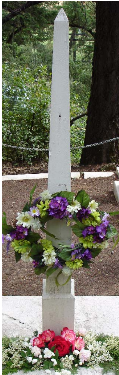
Obelisk at Calistoga Cemetery.

Col. Elmer Ellsworth Camp 23 and Ivy Stiers Auxiliary 23 once again joined Calistoga American Legion Post 231 in observing Memorial Day (May 30th). We participated in two ceremonies, the first at the GAR plot in Calistoga Pioneer Cemetery, and the second at the Veterans Memorial located in Calistoga's Logvy Park.