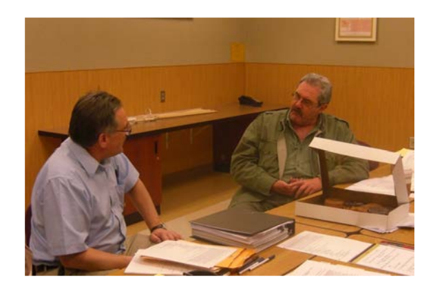
Junior Vice-Commanders I'll take the chocolate and you can have the Carmel

Everyone is invited to attend these sessions.