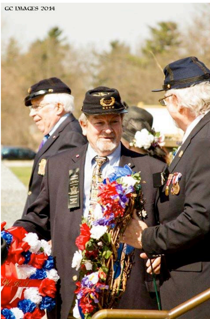
Lincoln Death Days celebration on 12 April, 2014.