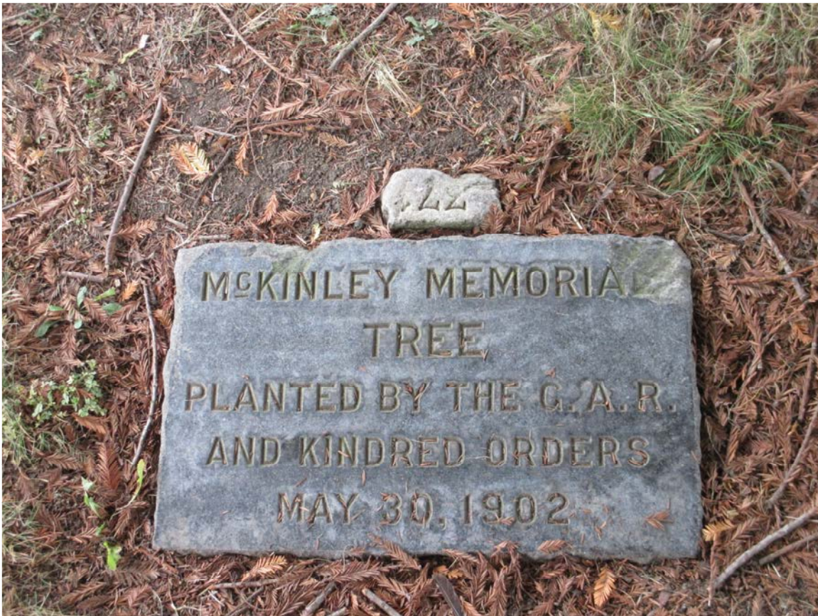
Photograph of the marker, near to the tree.