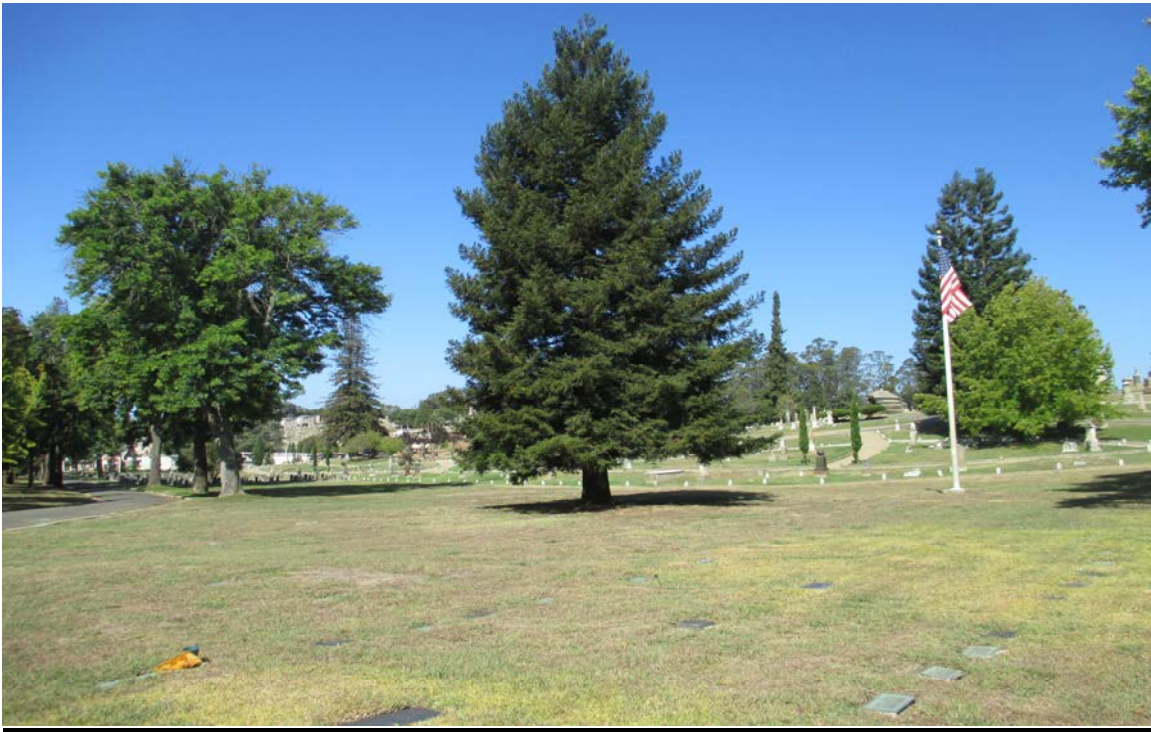
The McKinley Memorial Tree is shown in the center of this photograph.