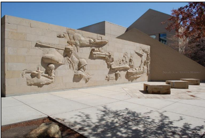
Nevada State Veteran's Memorial

The Annual Flag Day ceremonies and United States Army's birthday celebration will take place at the Nevada Veterans Memorial Wall located on the SE side of the Blasdel Building (209 E. Musser St, Carson City). All are encouraged to come and to wear your uniform if you please. Afterwards, we will likely walk over to Carson Street for lunch.