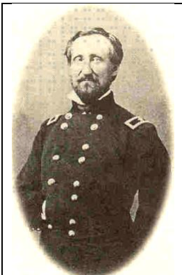
Gen. W. S. Rosecrans

Newsletter of Gen. William S. Rosecrans Camp No. 2, SUVCW – Los Angeles & Ventura Counties.